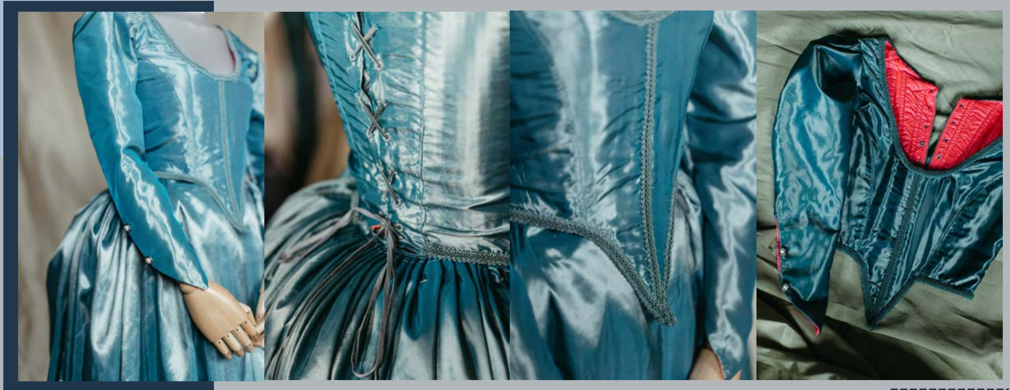
ROCOCO ERA BALL GOWN COMPLETED 2020