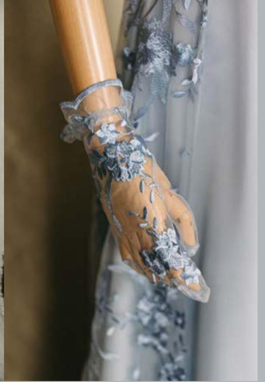
REGENCY ERA COSTUME COMPLETED 2021