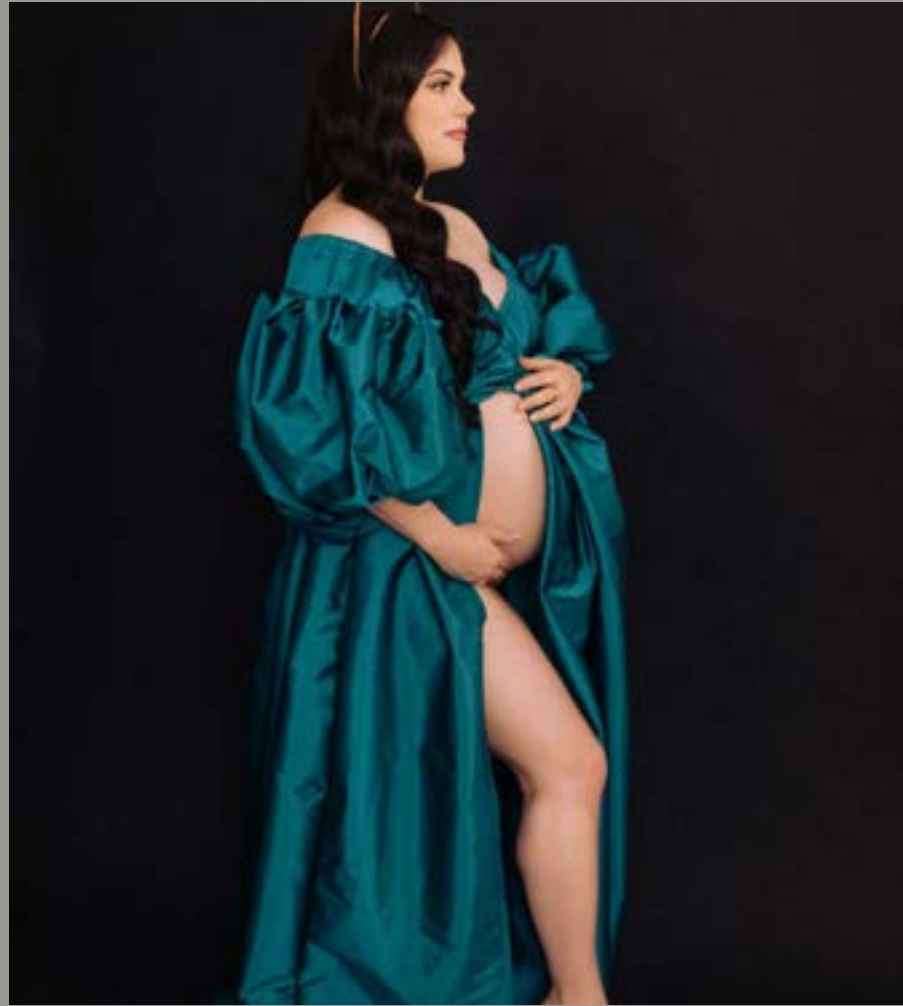
MATERNITY PHOTOSHOOT DRESS COMPLETED 2022