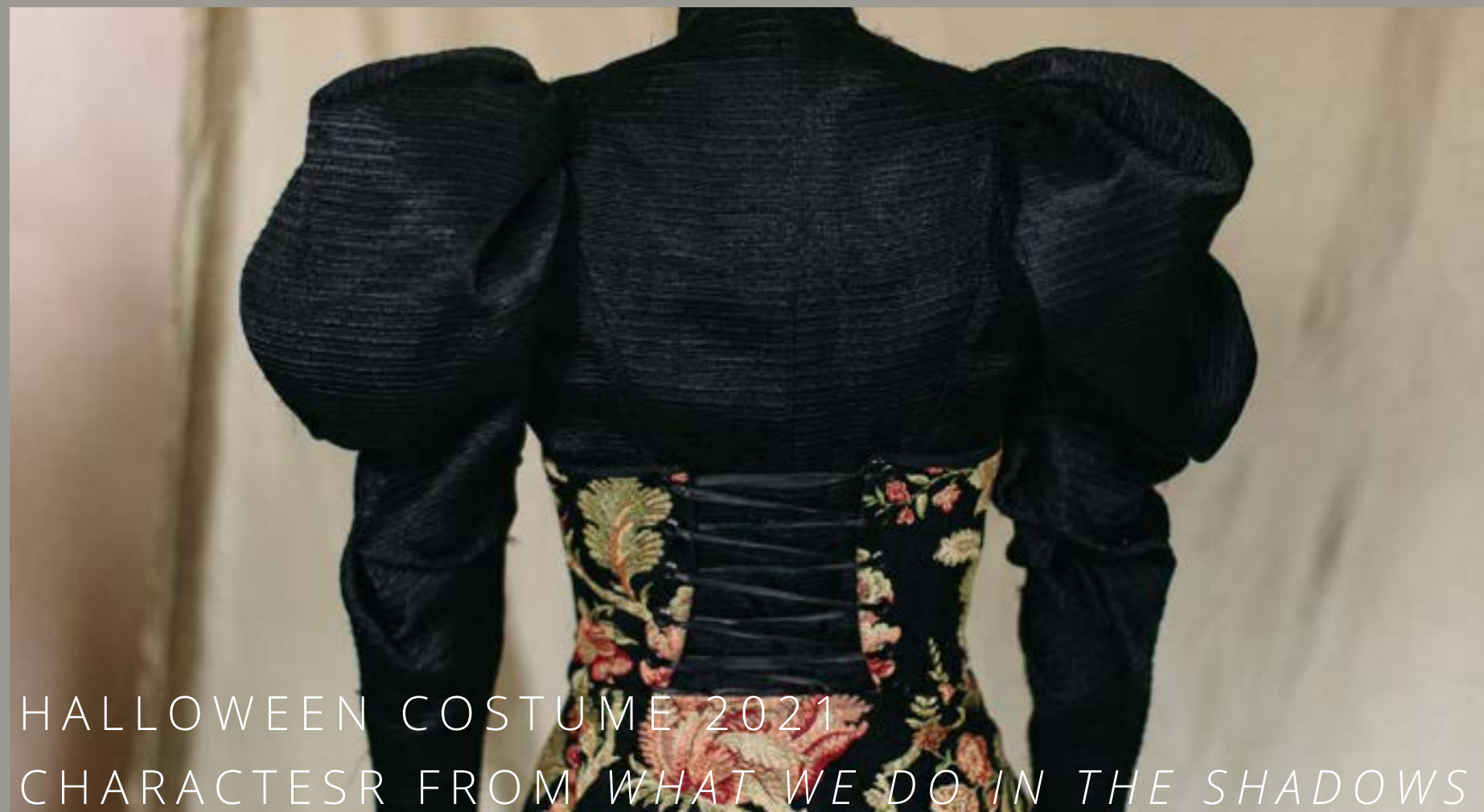
HALLOWEEN COSTUME 2021 CHARACTER FROM WHAT WE DO IN THE SHADOWS