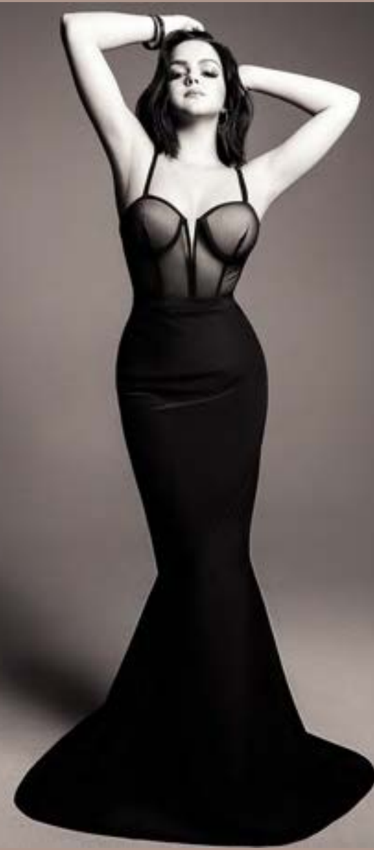
ARIEL WINTER IMAGISTA 2017 DESIGNED BODYSUIT