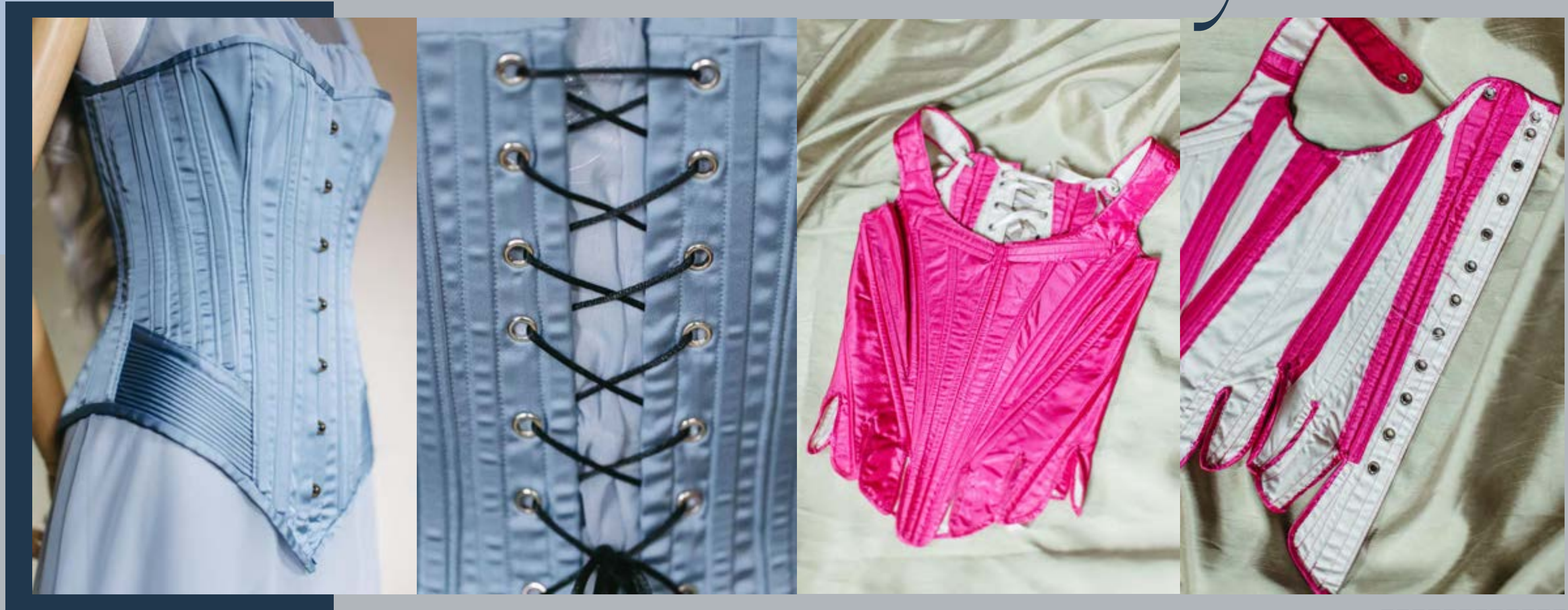
LATE VICTORIAN ERA CORSET COMPLETED 2022