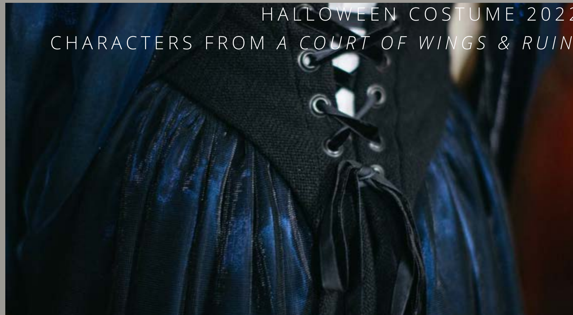
HALLOWEEN COSTUME 2022 CHARACTERS FROM A COURT OF WINGS & RUIN