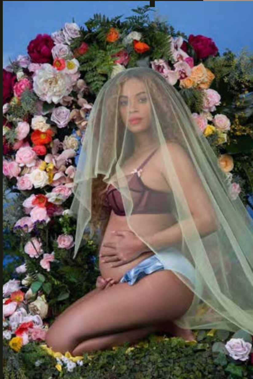
BEYONCE PREGNANCY ANNOUNCEMENT 2017; DESIGNED UNDERWEAR