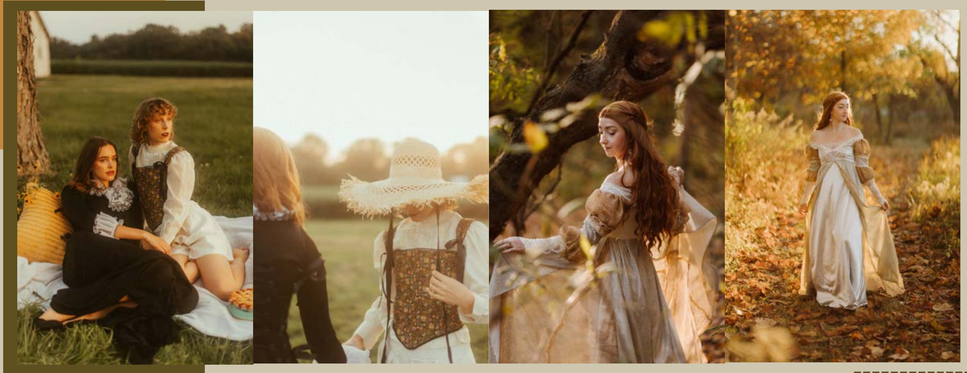
PROVIDED CORSETS FOR COTTAGECORE ENGAGEMENT SHOOT, 2021