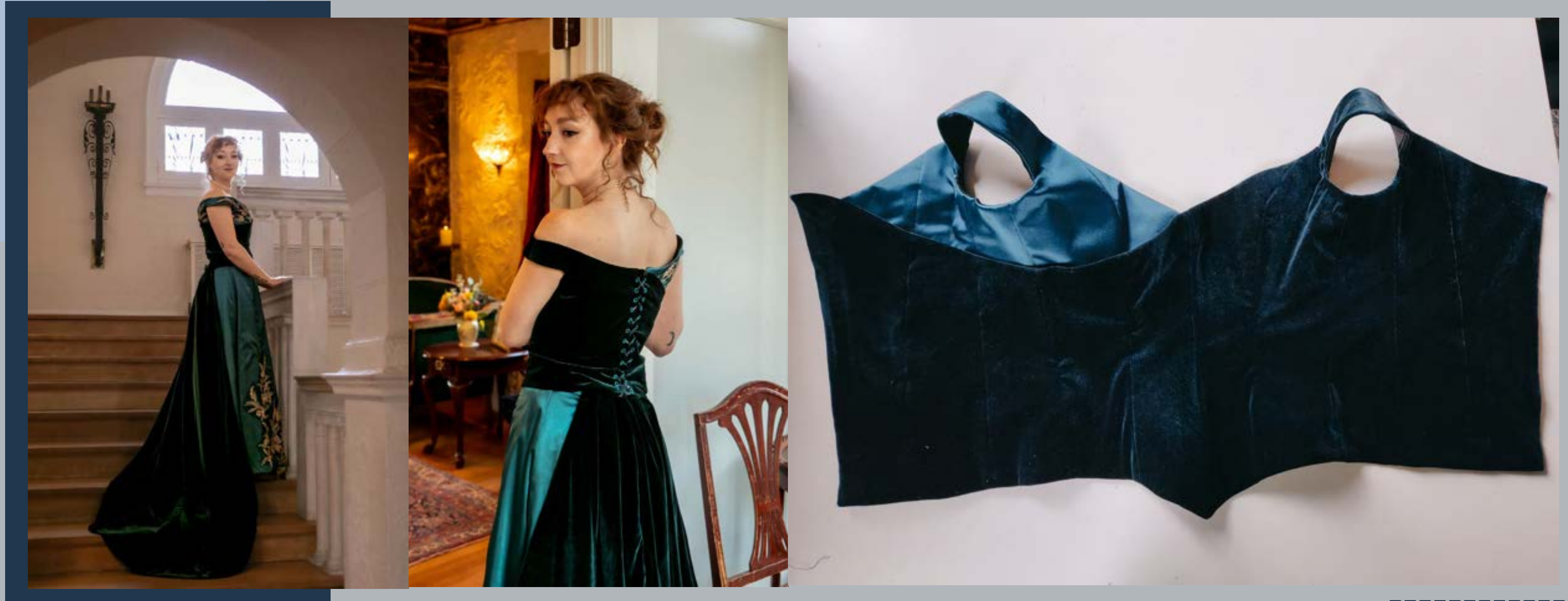
VICTORIAN ERA BALL GOWN COMPLETED IN 2023